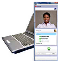
VG Connect Desktop