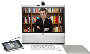
Cisco Ex60 or Ex90