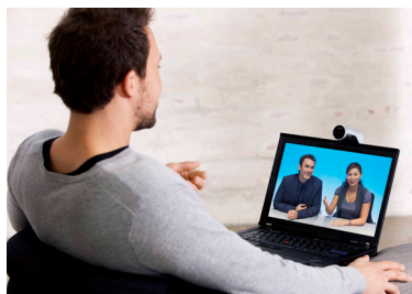
VG Connect Desktop