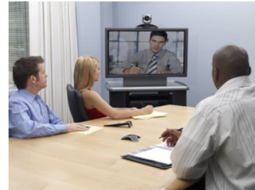
Polycom HDX 6000 or 7000