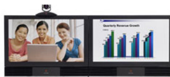
Polycom HDX 8000