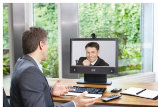
Cisco 1700 MXP