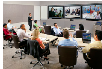
Polycom HDX 9000