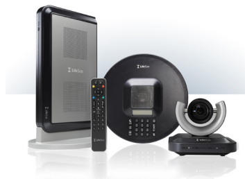
Lifesize Room 220