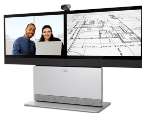
Cisco C60 or C90