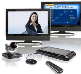
Lifesize Passport Express or Team 220