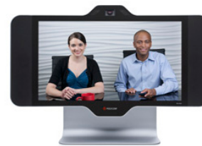
Polycom HDX 4500